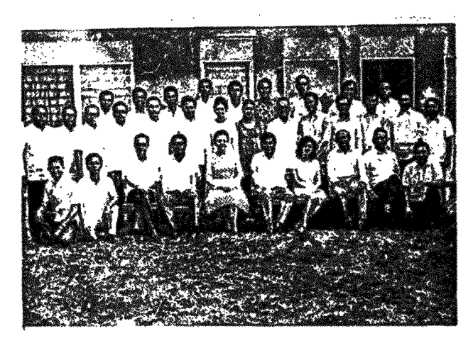
Seminer perticipants with the training staff,

The Institute of Planning, University of the Philippines, in coordination with the Department of Public Works and Communications (DPWC), sponsored the First Seminar on Environmental Planning and Infrastructure Development last March 8-May 31, 1972, Designed primarily to train the prospective personnel of the proposed Programming and Planning Development Office (PPDO) in the DPWC, the seminar was attended by some thirty participants, mostly representatives from the various bureaus and offices of the said department,