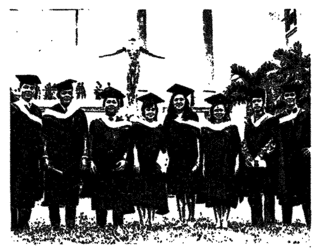
Some MEP'70 graduates.

Except for seven who were self-supporting, the other fifteen graduates had pursued the MEP program through scholarship grants from various sources.